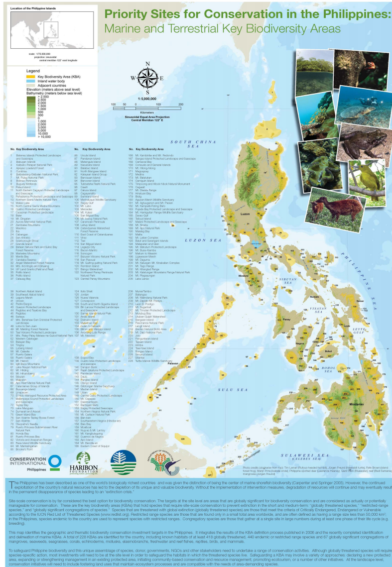
An integrated map showing the terrestrial and marine Key Biodiversity Areas of the Philippines. (Click the image to view the map in full resolution, or click here to download the map in PDF format.)

In brief, a total of 228 KBAs were identified in the Philippines, integrating a selection of 128 terrestrial and 123 marine KBAs delineated in 2006 and 2009, respectively. These KBAs cover over 106,000 square kilometers and are home to 855 species, including 396 globally threatened, 398 restricted-range, and 61 congregatory species (see box story on KBA selection criteria). It's important to note that while KBAs are recognized as priority conservation areas, not all of them are covered by proper legislative measures at the time of writing. In fact, majority of them remain unprotected or at least only partially protected.