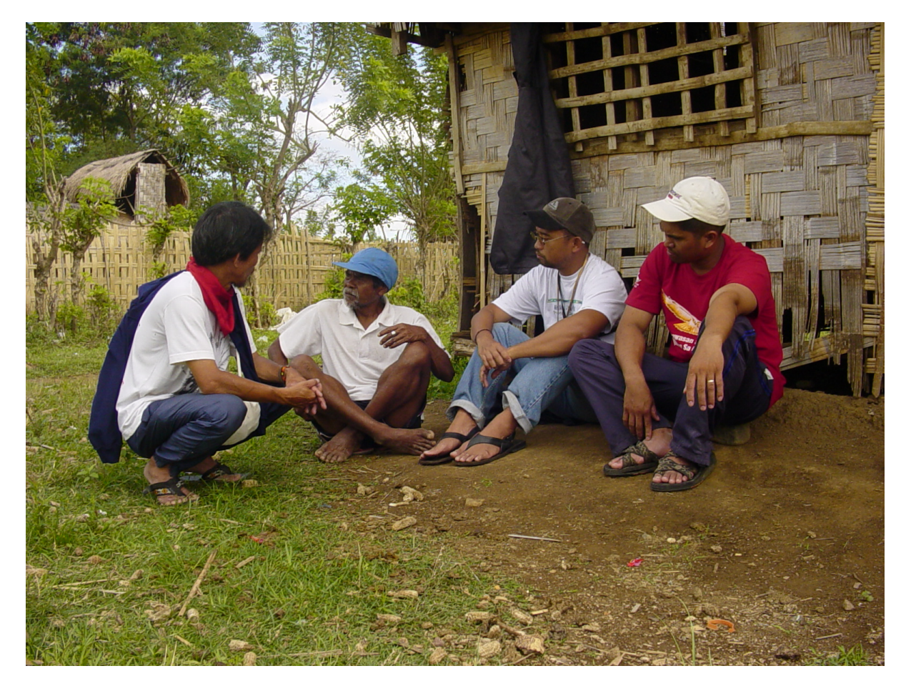
Collaboration with indigenous peoples – the traditional owners of the land – is an integral dimension of FPE's biodiversity conservation and sustainable development efforts. (FPE)

base is invaluable to the BCSD cause. From their stories, critical lessons may be extracted and adapted in combination with modern knowledge and technology. As a result, informed and sustainable strategies may be shared and set into action, not only on the local level but also on a national level wherever they may be adapted.