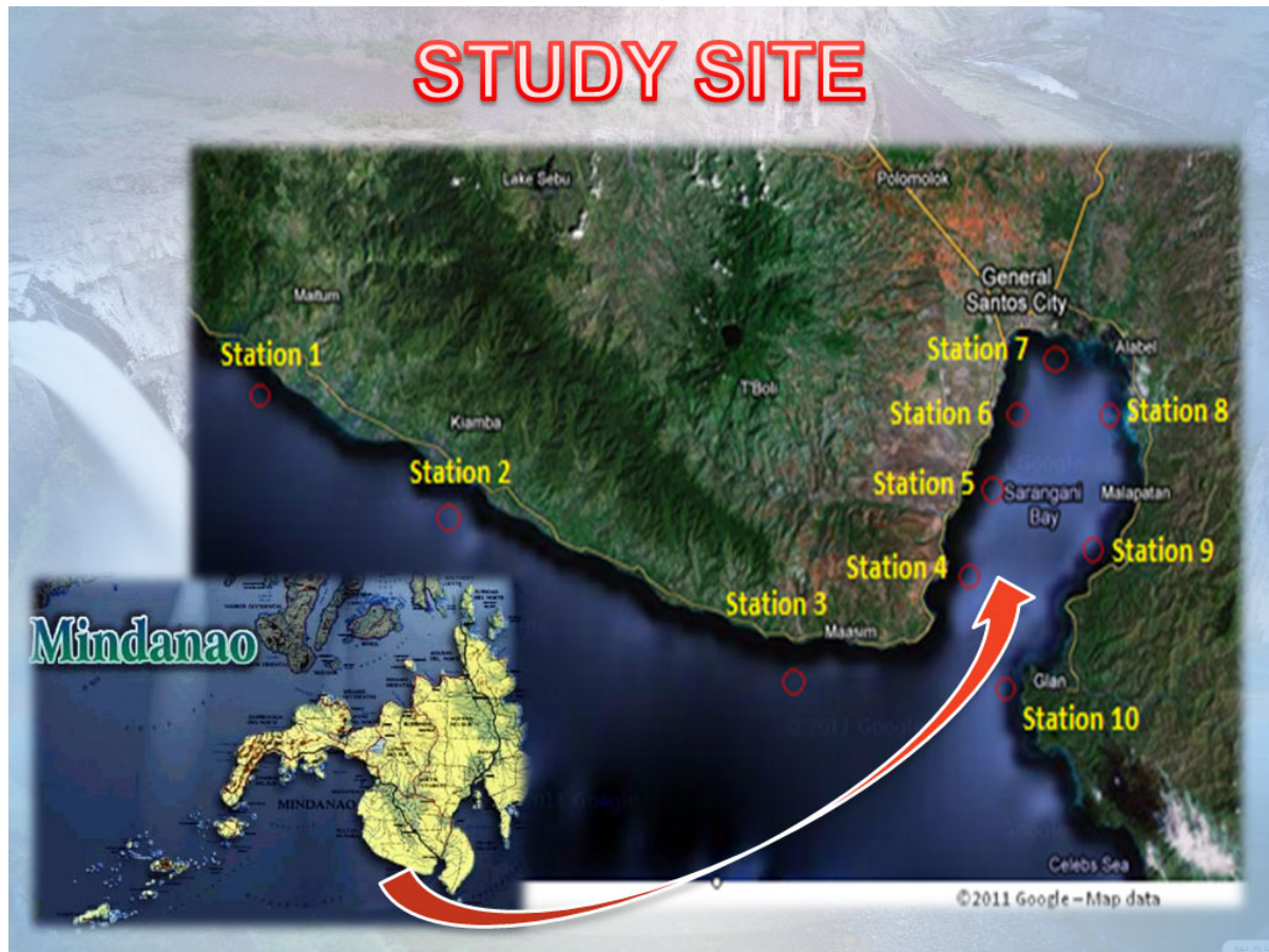
An illustration of the ten study stations where samples for this research were collected. (AMSUA/Oconer EP, et al.)

The first part of the study focused on quantitative detection of heavy metal contamination in waters and sediments and its uptake on various fish, shellfish, and seaweed species, while the second part dealt with histopathological (microscopic examination of tissue) studies. The contamination levels from the first part of the study were evaluated based on standard tolerable levels set by agencies such as the World Health Organization (WHO), US Food and Drug Authority (USFDA), Environmental Protection Agency (EPA), and the Department of Environment and Natural Resources (DENR).